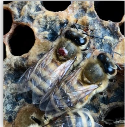
Figure 1. Adult female Varroa mite on the thorax of a worker bee.

DESCRIPTION AND BIOLOGY: Varroa mites are the most destructive pest of European honey bees ( Apis mellifera L.), and they have become increasingly abundant in the United States since 1987. The Varroa mite lifecycle takes place in two stages: an adult travelling stage and a reproductive stage. The travelling stage is made up of only fertilized adult female mites, which are generally 1.1 mm wide and 1.6 mm long. They are also reddish-brown in color, oval shaped, and covered in small hairs (setae) that help them stay attached to their hosts.