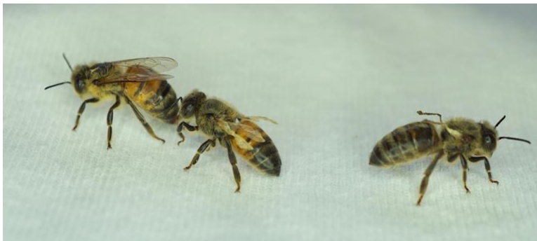
Figure 3. Apparent symptoms of deformed wing virus (DWV), which is one of the many viruses transmitted to bees through Varroa Mites. The worker on the left does not show any outward symptoms but is from the same hive as the other two bees with obvious symptoms.

Varroa mites feed on the honey bee fat body, which weakens host immunity and ultimately impacts bee nutrition, playing an important role in colony overwintering success. Additionally, Varroa mites are also known to transmit numerous viruses. Of the 18 known honey bee viruses, six are of primary concern, including: Deformed Wing Virus (DWV), Black queen cell virus (BQCV), Sac brood virus (SBV), Kashmir bee virus (KBV), Acute bee paralysis virus (ABPV), and Chronic bee paralysis virus (CBPV). However, DWV is now the most frequently observed of these viruses. The prevalence of DWV has caused the identification of European honey bees with symptomatic DWV to be a key indicator of Varroa mite infestation. Aside from the wing deformities that characterize this virus, symptoms of DWV can also include paralysis, abdominal bloating, early death, and learning deficiencies. However, it has been observed that over 99% of bees with DWV are asymptomatic (no wing deformities), making it difficult to grasp disease prevalence in the hive until it is too late. Because DWV can also replicate in European honey bees, it can be passed to eggs through the ovaries and spermatheca of infected queens and drones, and to larval stages through contact with infected nurse bees. Visible infection with DWV